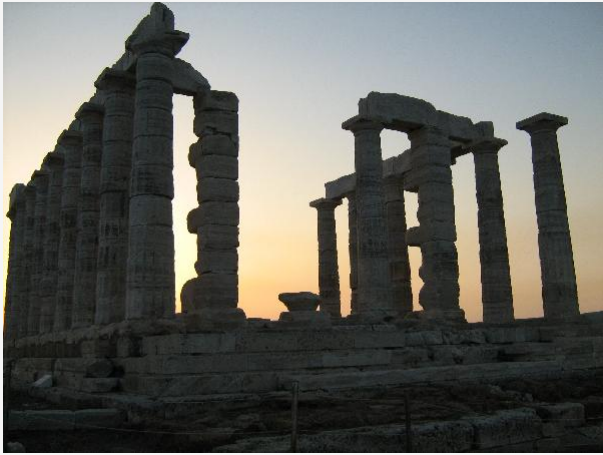
Watching the sun go down through the ancient building connected us with timelessness