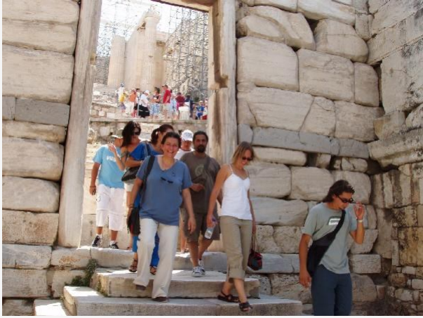
we headed in pursuit of other, equally important things