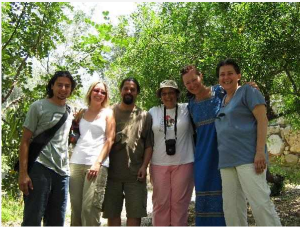
Next day, work done, all smiles in our little sanctuary near the Temple of Athena

techniques, psychic consciousness, the geometry sacred mathematics and architecture, use of sound, meditation and breathing techniques, amongst others.